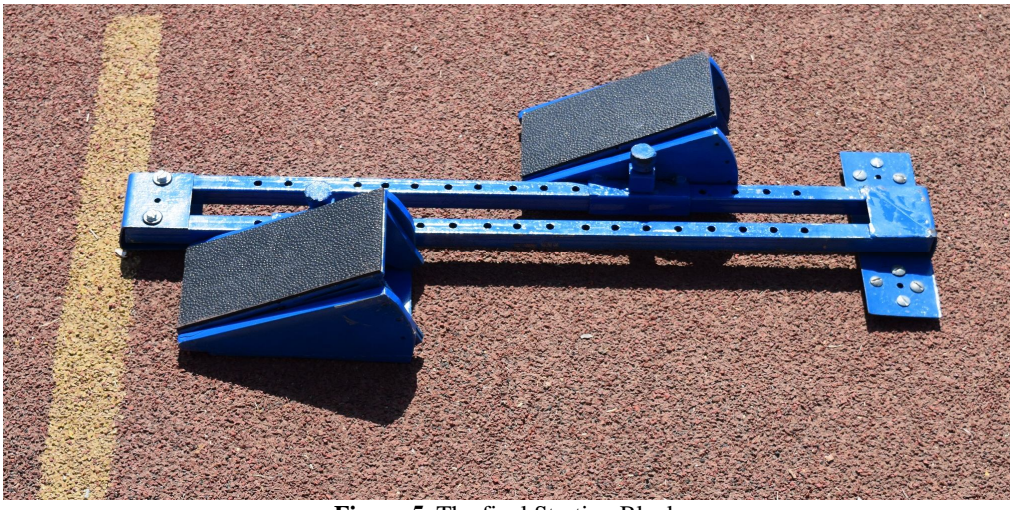
Figure 5. The final Starting Block