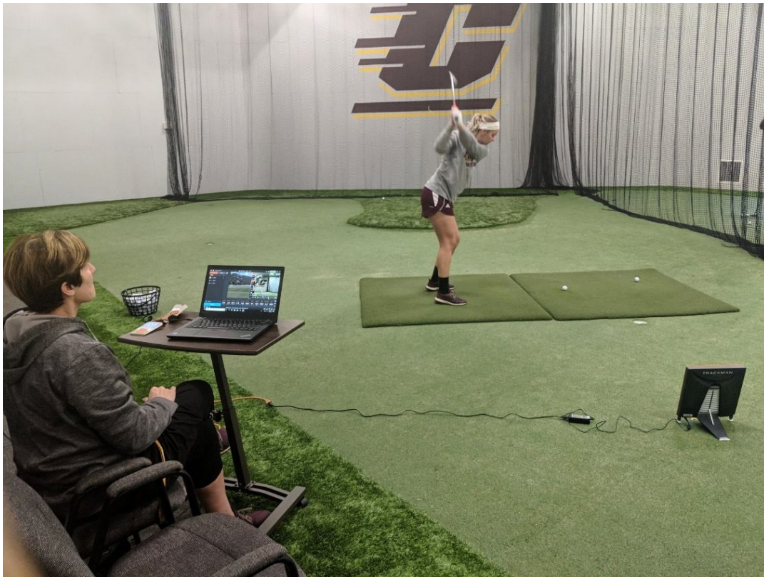
Figure 1. The experimental configuration.