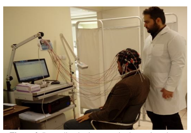
Figure 2. Recording brain waves in the resting phase

In the second stage, subjects watched advertisement video regarding Nike brand and their brain waves were recorded by the EEG device. This process was exactly done like the first process the difference was that testes were watching Nike brand advertisement (Figure 3).