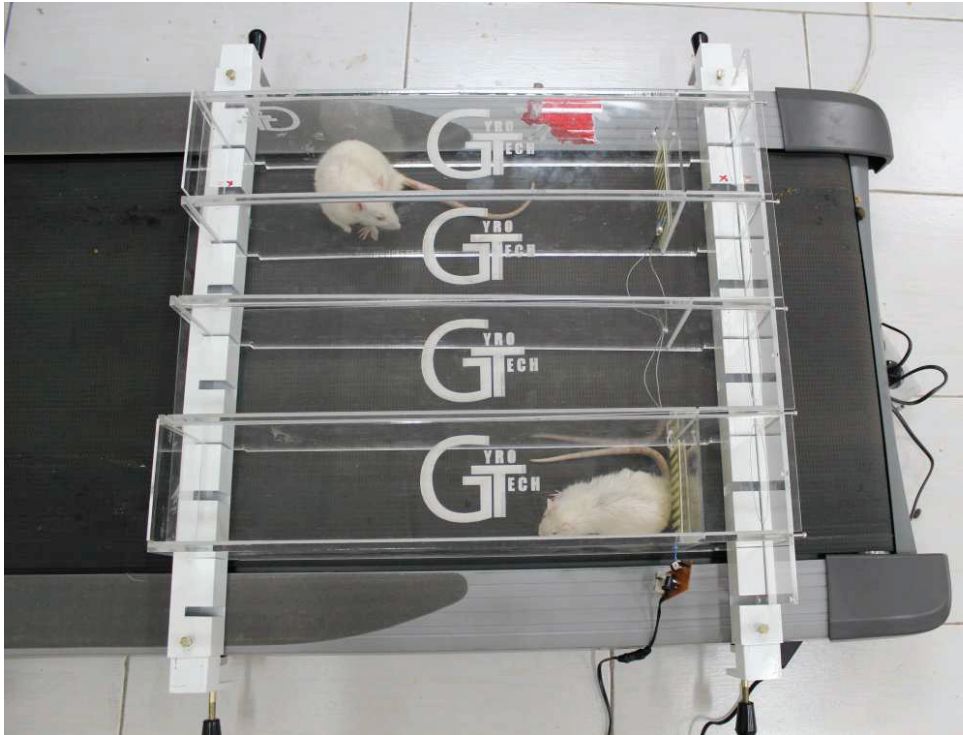
Figure 2. The mouse treadmill compartment on a human treadmill.

To this end, aluminum profiles, which were chosen after calculation of machining, were used.